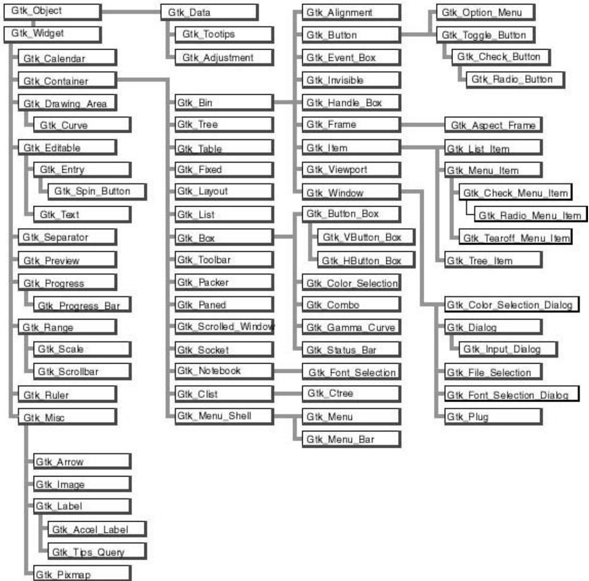
Fig. 1: Widgets Hierarchy